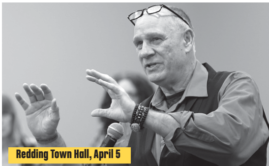
Redding Town Hall, April 5

As our bargaining team prepares to win a contract that reflects the values of our union, our members are stepping up and speaking out to share their ideas about what matters most. Already, thousands of members have attended 19 town halls across the state—with five more scheduled through Apr. 27.