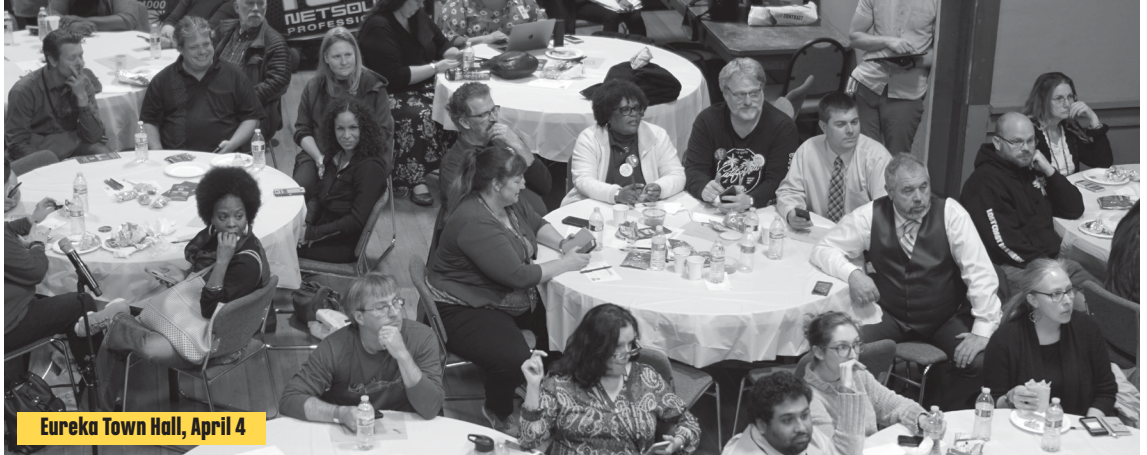
Eureka Town Hall, April 4