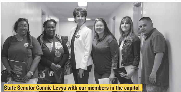
State Senator Connie Levya with our members in the capitol

We're making politics matter in our fight for A California for All. As we went to the bargaining table, our members went to the Capitol to educate lawmakers about who we are and reinforce the value of the work we do for the state of California. Multiple legislators expressed their support and took photos with our members to show everyone across the state that they are prepared to stand with SEIU Local 1000.