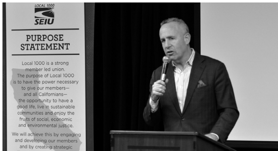
Sacramento Mayor Darrell Steinberg at an Oct. 19 Town Hall addressing members about improving city services and the importance of Measure U.