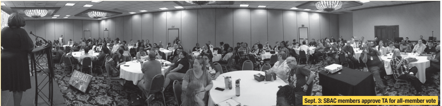
Sept. 3: SBAC members approve TA for all-member vote